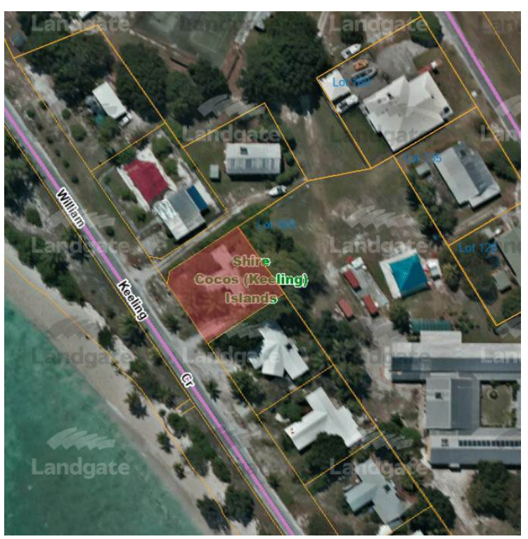
Lot 120 (House 20) William Keeling Crescent, West Island

<u>Available for viewing at the meeting.</u> Plans/images in attachments.